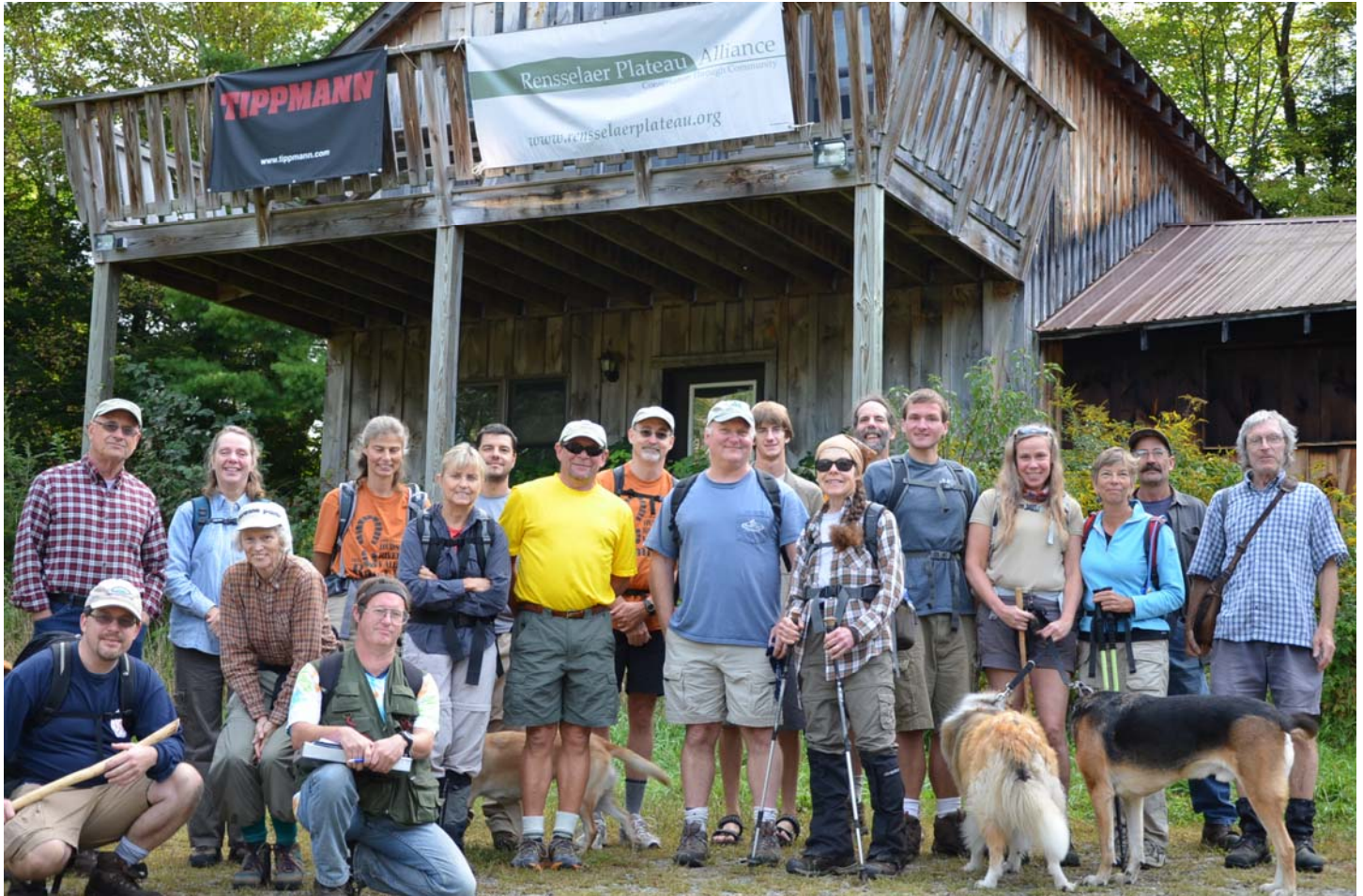
Participants in the 2 nd Annual Rensselaer Plateau Traverse Hike