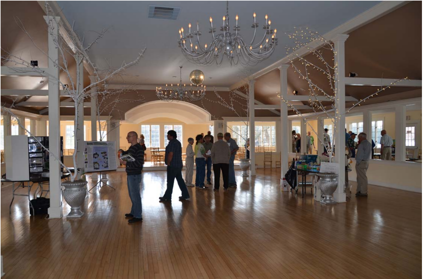
Open house for landowners at the beautiful and historic Crooked Lake House – April 6, 2011

Howard, Esq and the Rensselaer Plateau Alliance). to discuss and learn about options for conserving their land. Participants reported that it was a very successful event. The event was set up around the edge of the large banquet hall along the windows looking out over the lake. It was an absolutely beautiful venue. Our final tally was 66 people not counting presenters.